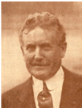
MYRON T. HERRICK